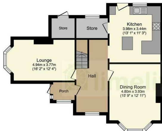
Ground Floor Floor area 64.5 m 2 (694 sq.ft.)