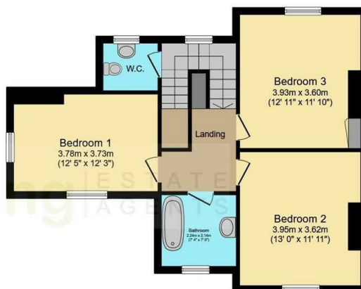
First Floor Floor area 60.4 m 2 (651 sq.ft.)